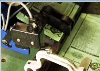
Feeder timing controlled by holding down ski arm triggering micro-switch.

The EX Series Feeder is designed to clamp on the front table of most inserters, which adds extra stations to your existing machine. Quickly turning your 6-station inserter into a 7, 8 or 9 station. For those with a 12-station inserter, you can expand up to a 20 station. Adding stations to the operator side provides easier access for the operator and saves on space. The 900 EX sits across from a station and ejects an insert into the track underneath the jaw of the opposing pocket. Variable speed control and miss detection are standard features. Double detection, batch counting and delay/interrupt are optional features.