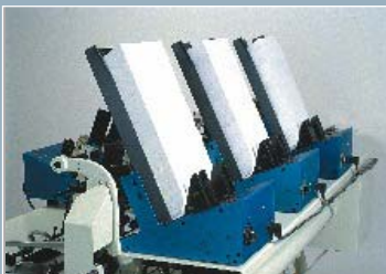
Replace all of the inserter vacuum stations with friction feeders.

The EI Model feeders are designed to fit on the back of your inserter to replace the vacuum suction cup method. The EI feeder comes in two models: the 900EI to replace stations on 6x9 inserters and the 1200EI to replace stations on 9x12 inserters. These feeders are compatible with Bell & Howell™, Mailcrafter™, EMC™ or Pitney Bowes™ swing arm inserters.