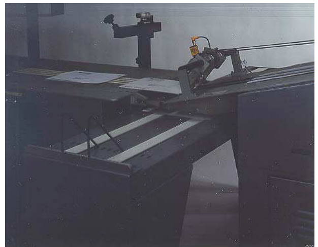
Minimal set-up time is needed because the KR 630 rolls into position over-top the shingle conveyor.

Specifications subject to change without notification Guards have been removed for clarity. Do not operate machine without guards in place.