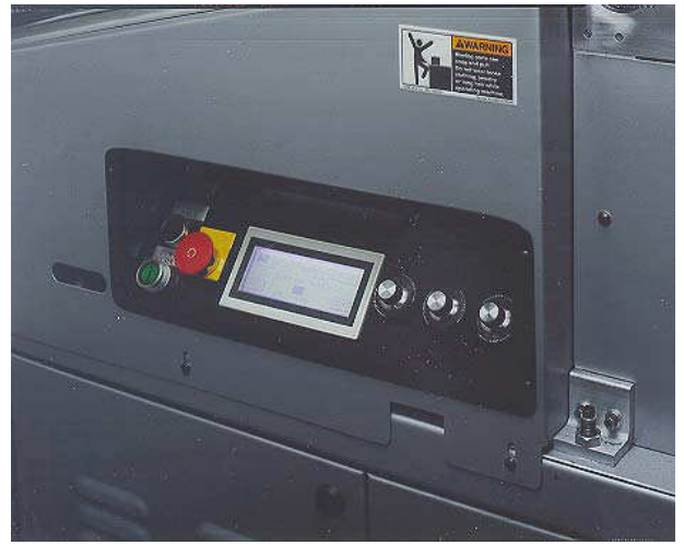
A straightforward operator interface simplifies operator training and setup